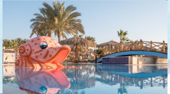
LA CASSINA POOL